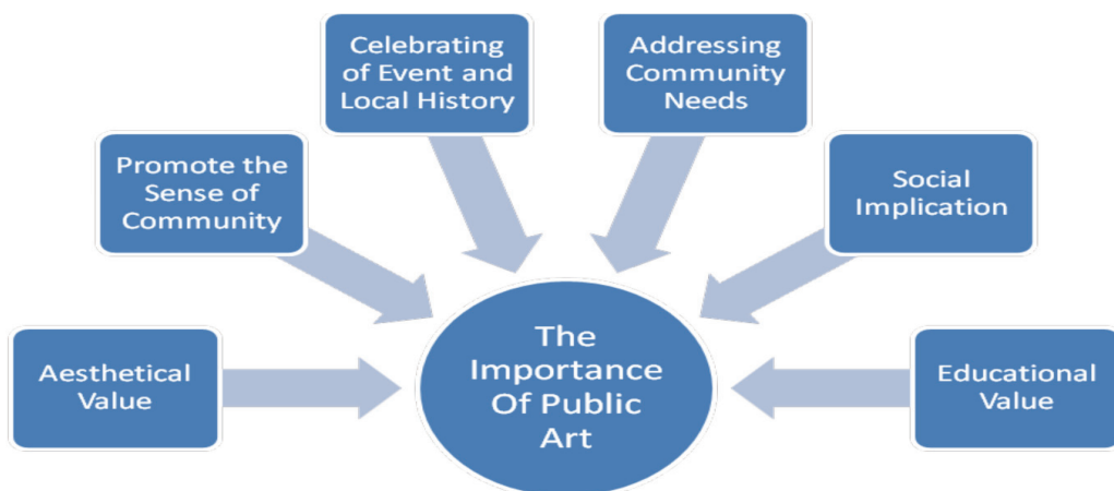
Fig.2: The importance of public art towards quality living environment

In term of aesthetical value, public art carries the basic notion of art which is to beautify spaces. As argued by Hall (2003), art has traditionally been placed in the public realm for reasons of aesthetic enhancement and memories container. In addition, Baker (1998) claims that art is seen as a way to rejuvenate cities by enhancing public spaces. This beautification of cities by public art encompasses vibrant street life by